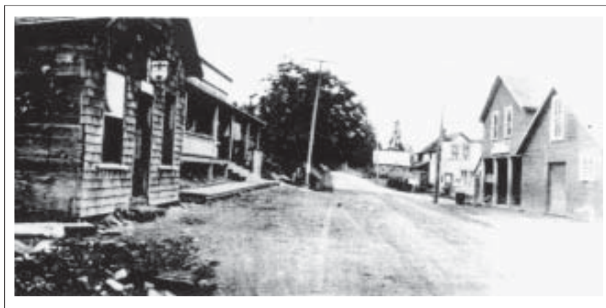
Whonnock, River Road facing east. The photo by Marshall Luno around 1925. On the left side the Whonnock post office and F.W. Showler's store which was built by Nils Nilsen in 1920-21. On the right A. Graham's warehouse and store. In the background Luno's store and barn. Photo courtesy Marjorie Malm.