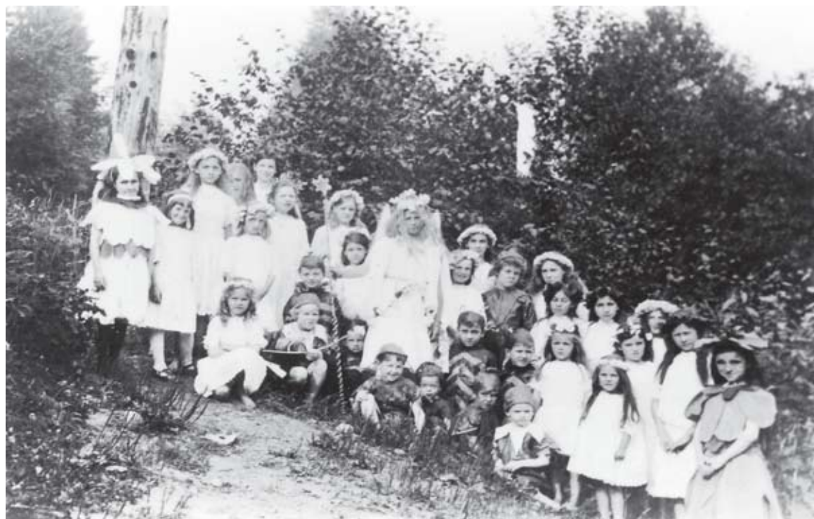
A pageant at the Hall in Whonnock in 1915.