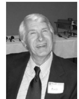
Thumbnails of the 2008 Volunteer Dinner and the celebration of the 20th year of Whonnock Lake Centre