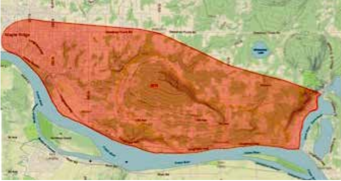
Grant Hill aquifer boundaries